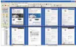
The AvScan 5.0 main screen