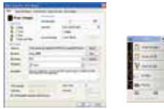
The Button Manager V2 main screen

Button Manager V2 makes it easy for you to scan and send your image to your favorite destinations with a press one button. Now the new version comes with an innovative feature to let you scan and automatically upload the scanned document to popular cloud repositories such as Google Docs, Microsoft SharePoint, or FTP. In addition, the iScan feature allows you to insert the scanned image or recognized text after optional OCR (Optical Character Recognition) process to your text editor such as Microsoft Word to get your job done easily and quickly.