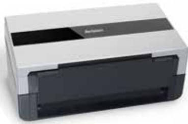
Dust Cover Design