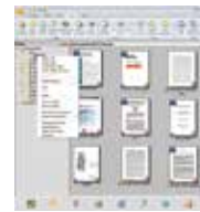
The PaperPort SE14 main screen

- The Professional Choice to Organize and Share Your Documents