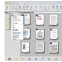
The PaperPort SE 14 main screen

- The Professional Choice to Organize and Share Your Documents