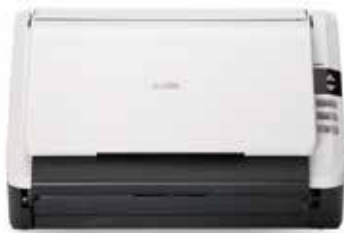
Input and output paper tray can be fold when not in use.